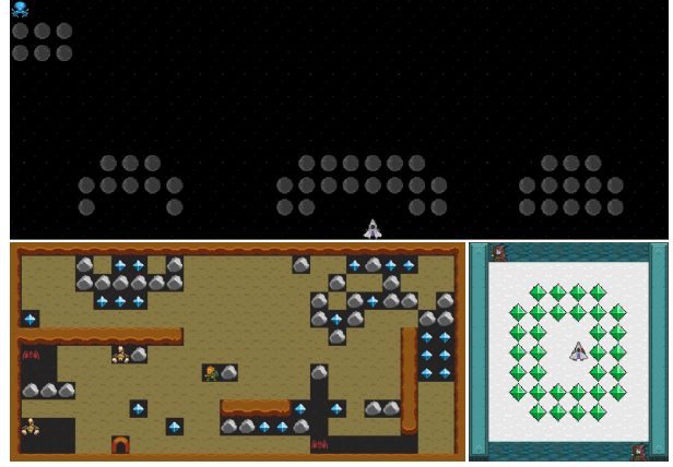
Fig. 1: The VGDL experimental levels in order from top to bottom right: Aliens, Boulderdash, and Solarfox.